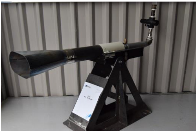
NexGen Sonic Burner

In addition to this standard equipment, our significant selling point is that we have the engineering and design know-how in-house to develop and build bespoke rigs which are capable of simulating the actual operational conditions to which components within designated fire zones can be exposed.